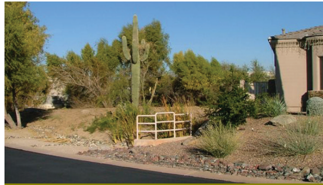
Providing a Defensible Space will protect your home

Unless you plan to haul it away yourself, coincide your brush clean up with Scottsdale Solid Waste's monthly brush and bulk collection.