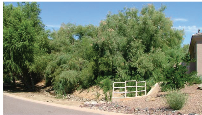
Overgrown trees & bushes provide fuel for wildfires

If you have any questions about the Fire Danger Level in your area, call the Scottsdale Fire Department at 480-312-1855.