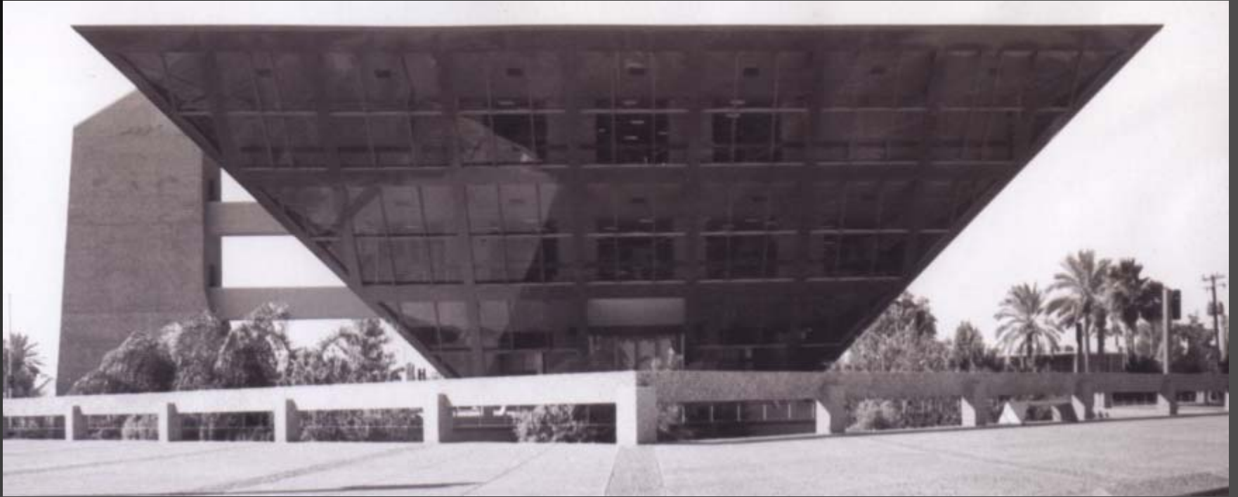
Tempe Municipal Building Michael Goodwin (1966-71)