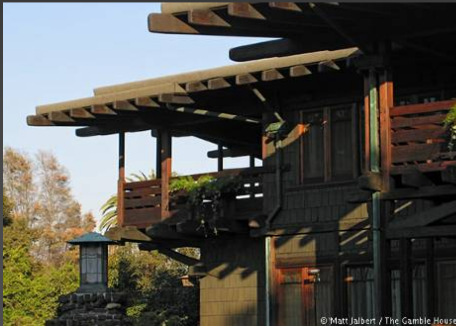
Gamble House Greene & Greene Architects