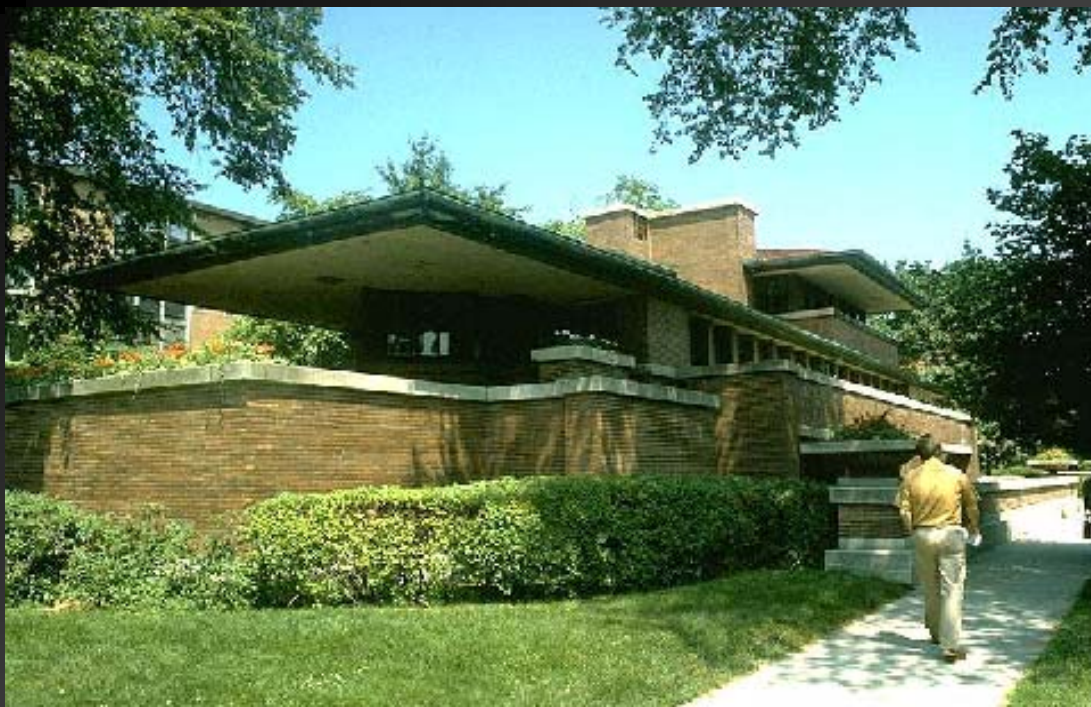
Robie Residence, Chicago Frank Lloyd Wright