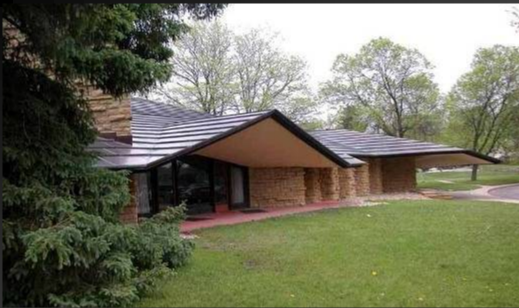
Unitarian Meeting House Frank Lloyd Wright