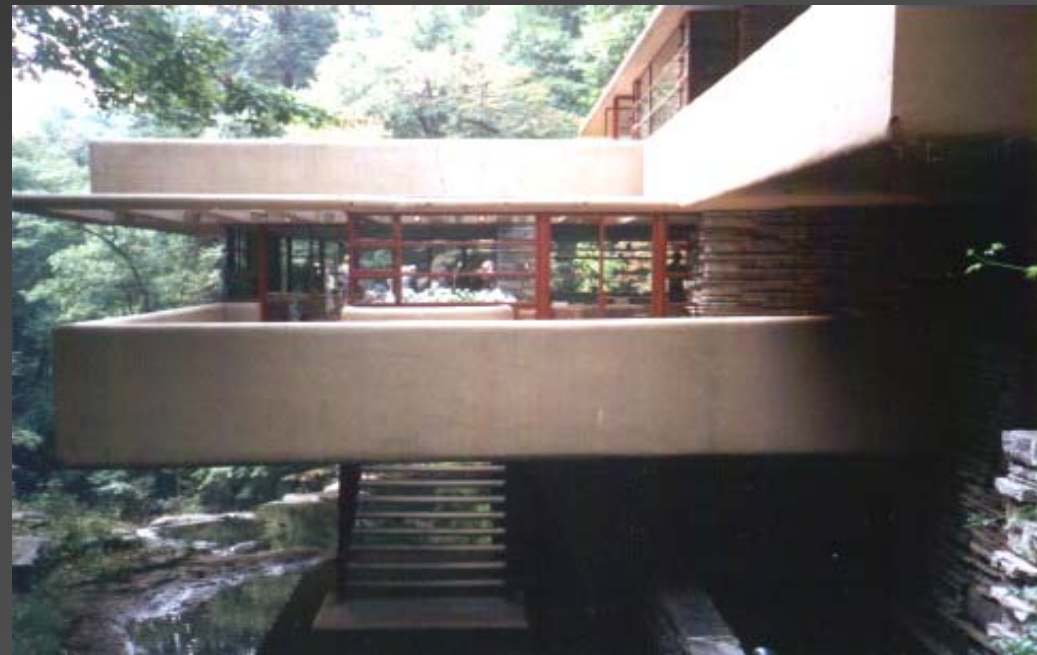
Fallingwaters, PA Frank Lloyd Wright