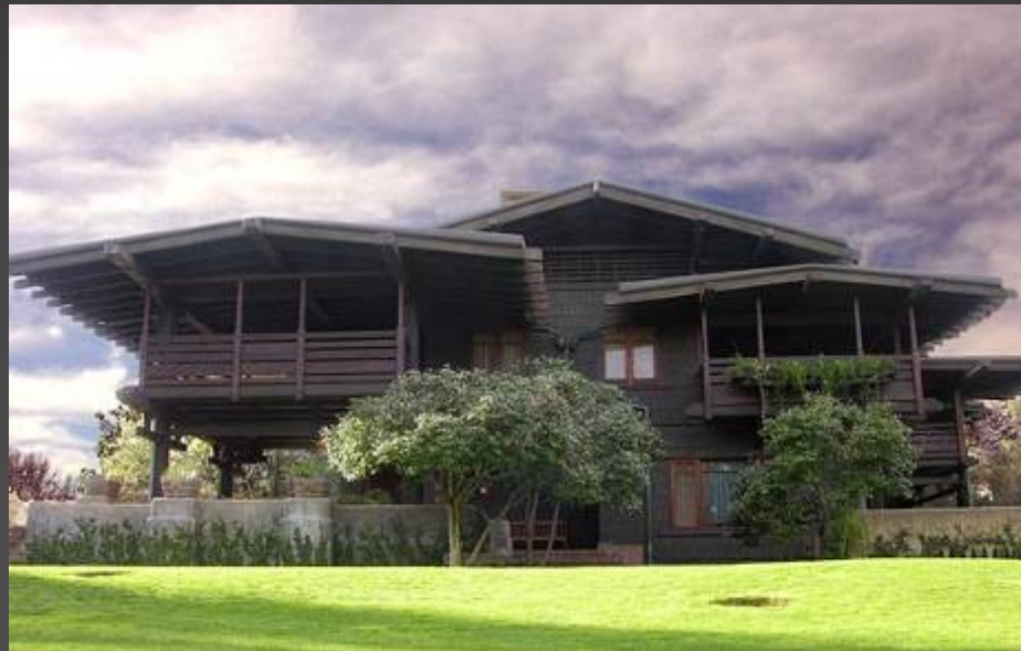
Gamble House Greene & Greene Architects