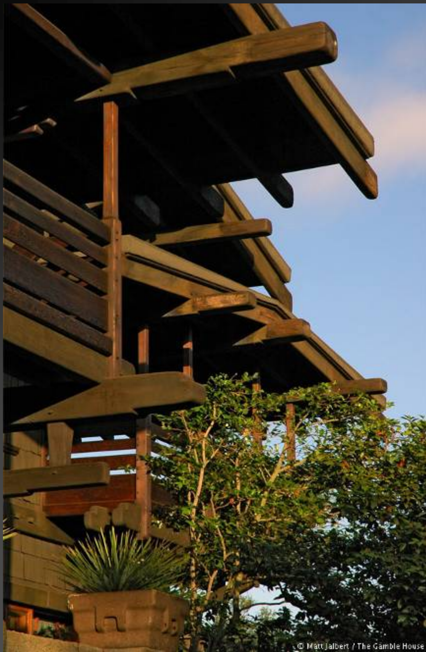
© Matt Jalbert / The Gamble House