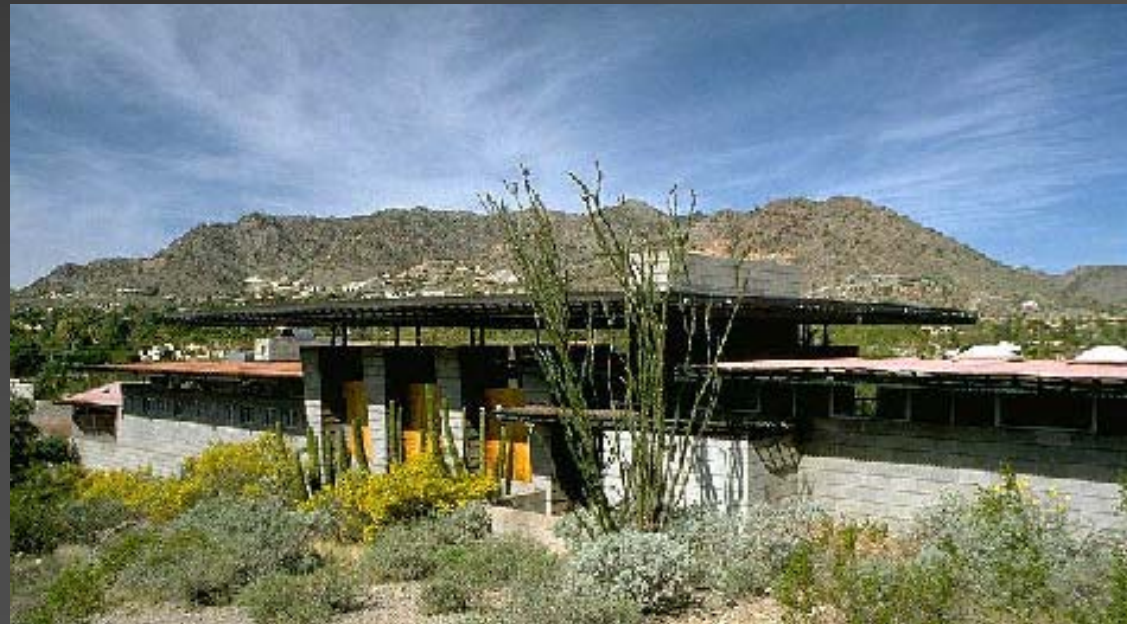
Price House, Paradise Valley Frank Lloyd Wright