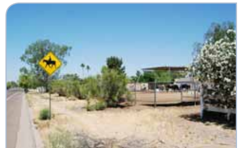
Equestrians are encouraged to utilize the area's non-paved trail system.