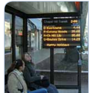
Bus route wait time displays make transit use more convenient and user-friendly.