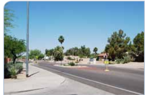
Streets south of the Greater Airpark, such as Thunderbird Road and Sweetwater Drive (pictured), should remain neighborhood-serving.