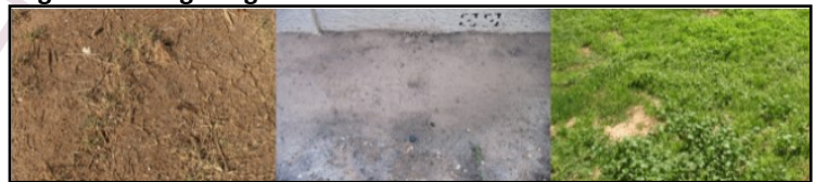
Figure 2: Ineligible grass

The first image is a grass at less than 50% density. The second image is of a designated grass area that is bare dirt. The last image is over 50% weeds.