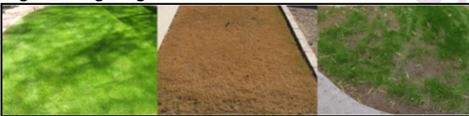
Figure 1: Eligible grass

The first image is an example of healthy grass at 100% density. The second image is an example of dormant or dead grass at 100% density. The last image is of grass at the minimum 50% density.