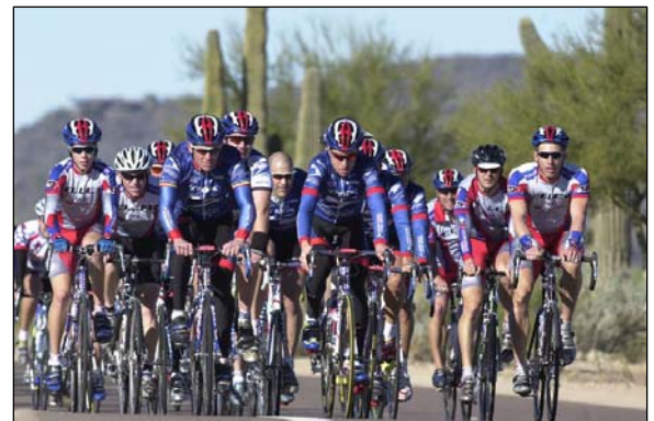
Lance Armstrong and company in Scottsdale with local Bicycle Ranch riders. January 2002

Active bicyclists are involved at all levels of government. We are on the City Council, the Transportation Commission, and the staff. We really do bicycle here. Bicycling is one of the environmental values demonstrated and supported in the community, which include nationally recognized Green Building and Desert Preservation programs.