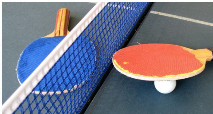
TABLE TENNIS TOURNAMENT

5/5 | 12:30 p.m. | $5 (R) / $7 (NR) | #111578 | VLSC