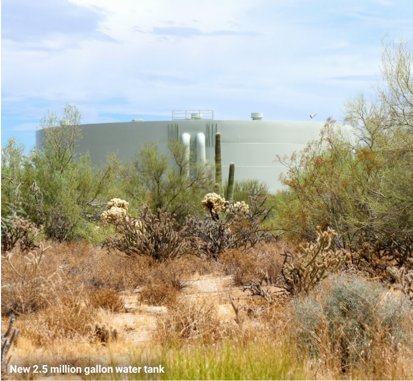
New 2.5 million gallon water tank

Water Management projects ensure delivery of safe, reliable water and water reclamation services.