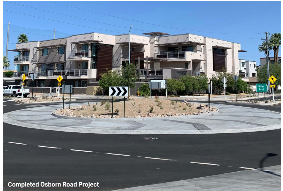
Completed Osborn Road Project

Work will be completed to widen the road and install drainage improvements on Pima Road between Pinnacle Peak and Happy Valley roads and on Happy Valley Road from Pima Road to Alma School Road.