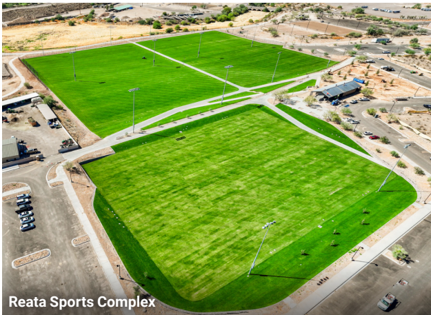
Reata Sports Complex

Community Facilities help the city deliver services via recreation facilities, parks, paths, aquatic centers, libraries and senior centers.