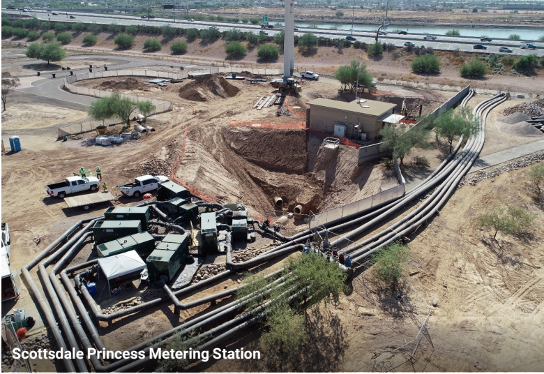
Scottsdale Princess Metering Station

Water Management projects ensure delivery of safe, reliable water and water reclamation services.