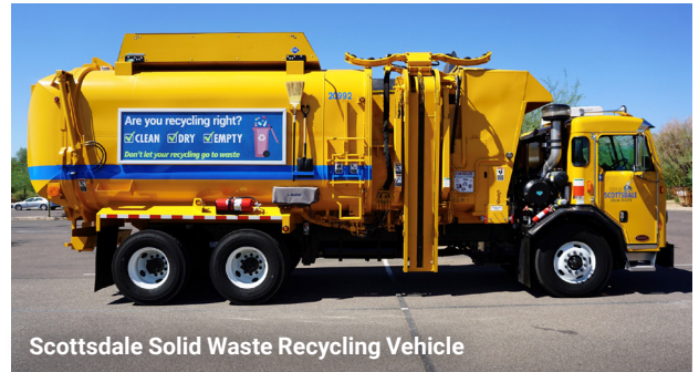
Scottsdale Solid Waste Recycling Vehicle

The design phase has commenced for two solar projects under the Bond 2019 program at the Civic Center campus. These initiatives aim to boost solar power generation and lower energy expenses at the campus. Enhancing energy efficiency in public facilities and expanding the use of renewable energy align with objectives outlined in the current General Plan.