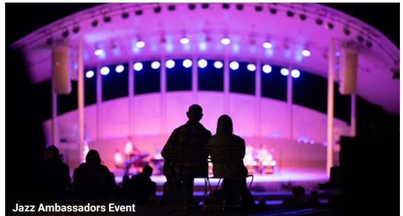
Jazz Ambassadors Event