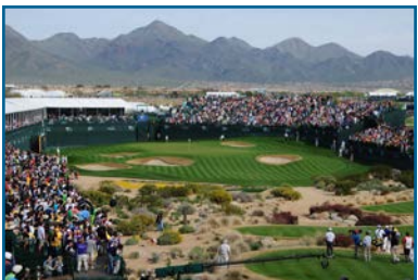
③ TPC Scottsdale