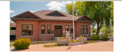
⑪ Civic Center