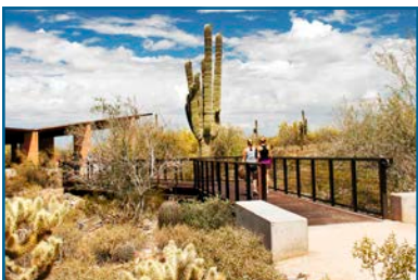
② Preserve Gateway and Scottsdale's McDowell Sonoran Preserve