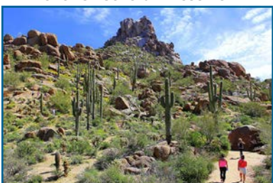
① Pinnacle Peak Park