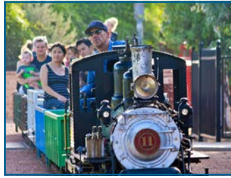
⑦ McCormick-Stillman Railroad Park