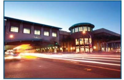
⑨ Scottsdale Fashion Square