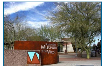
⑫ Scottsdale's Museum of the West