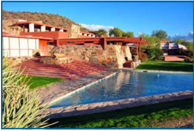
⑥ Taliesin West