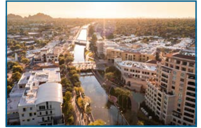
⑩ Scottsdale Waterfront