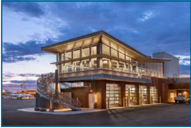
⑤ Scottsdale Airport/Airpark