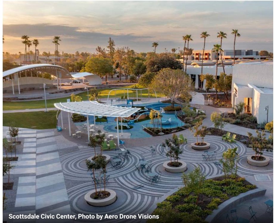
Scottsdale Civic Center

The newly remodeled and award-winning Scottsdale Civic Center is a vibrant testament to the city's commitment to public engagement. Realizing the vision developed by the community, Civic Center returned as a signature venue, perfect for events and gatherings, casual strolls and relaxation in the historic heart of Scottsdale. Approved by voters in the 2019 Bond election, this project includes a new 360 Stage with surrounding lawns, splash pad and new water features and landscaping, saving 400,000 gallons of water. Residents can enjoy new outdoor activities, events and concerts as well as enjoy the world-class public art and access key community spaces such as the Civic Center Library, City Hall, Scottsdale Museum of Public Arts and the Scottsdale Center for Performing Arts.