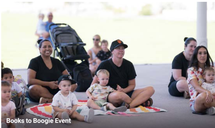
Books to Boogie Event

Through digital and physical spaces, Scottsdale progresses as a sophisticated city while maintaining our small-town charm.