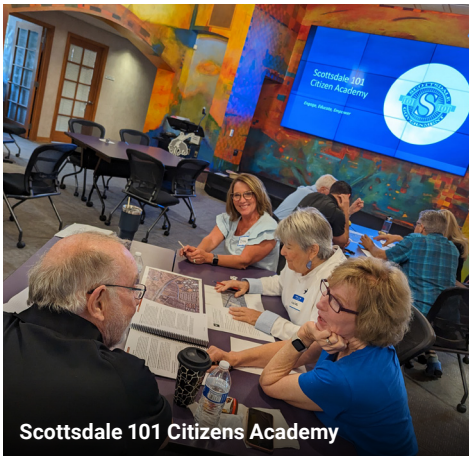
Scottsdale 101 Citizens Academy

Scottsdale fosters transparent, responsive and collaborative community involvement