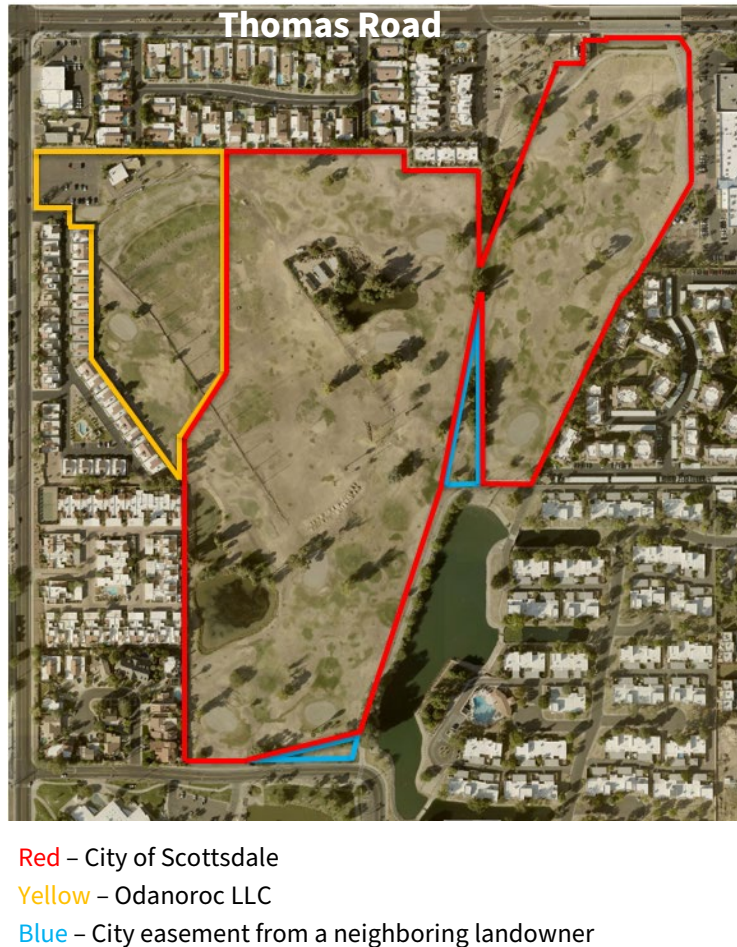
Figure 1. Coronado Golf Course Land Ownership