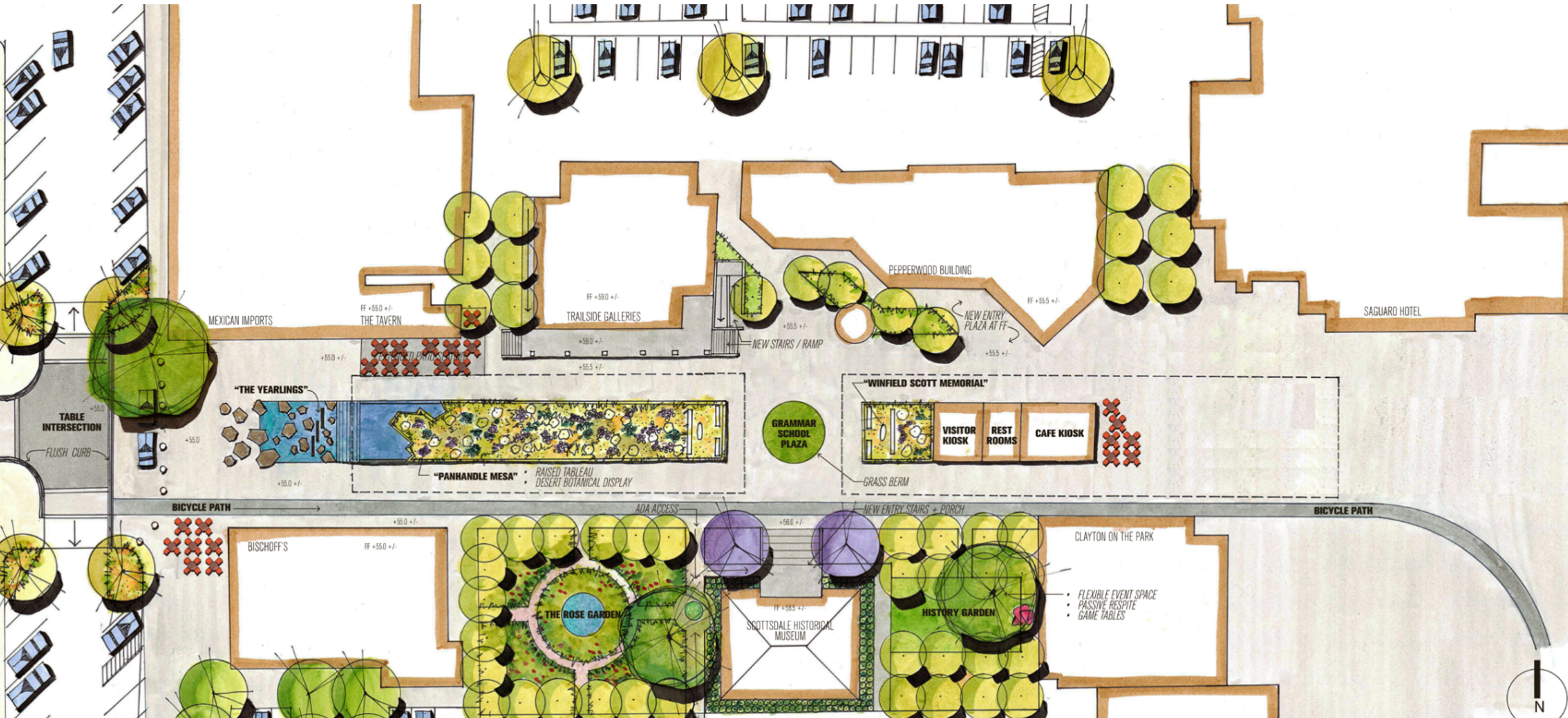
DETAIL: WEST ENTRANCE