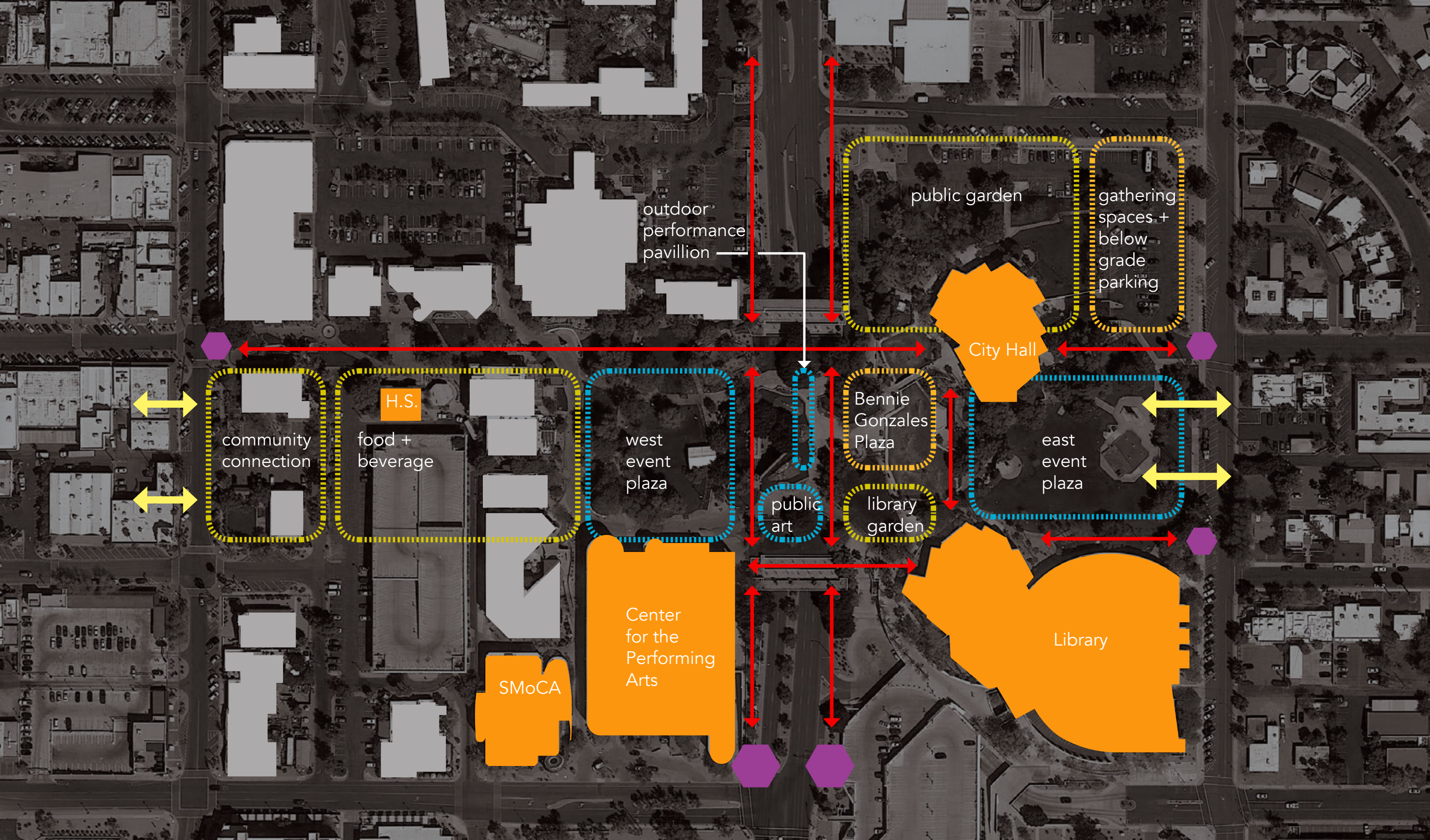
CIVIC CENTER: USE DIAGRAM