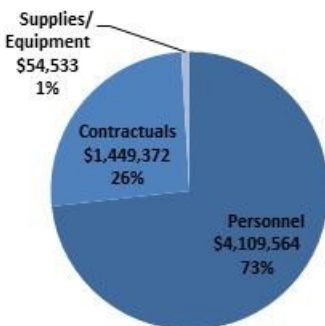
Expenditures: What City Budgets for Court

The total monies collected by the Court is $18,429,116. The total City General Fund and Special Fund expenditures for Scottsdale City Court for Fiscal Year 11/12 was $5,613,469.