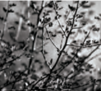
Blue Palo Verde

Any project which affects plants from the specified list is required to submit a native plant program detailing the existing location and proposed treatment of each protected plant impacted. Protected plants should, at the most optimal situation, remain in