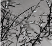
Foothill Palo Verde