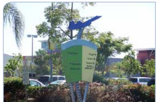
Signs and art which celebrate aviation could promote a unified identity to the area.