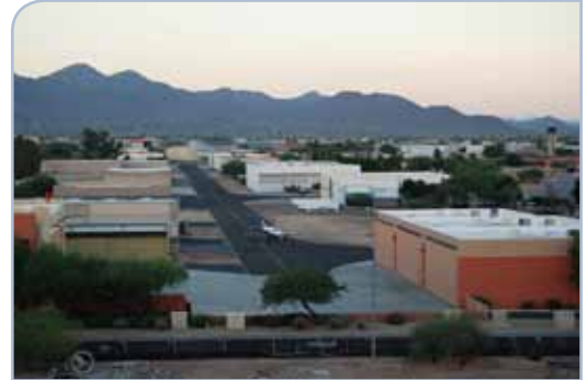
A unique aspect of the Greater Airpark is private property access to taxilanes, also known as “through the fence operations”.