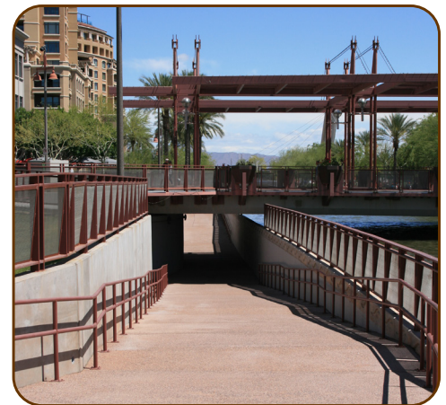
The Marshall Way Bridge underpasses provide increased connectivity along the canal in Old Town.