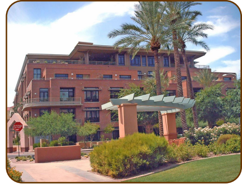
As the residential population of downtown increases, so too will the need for an interconnected public realm and open space network.

Improve, expand, or create new public realm and open space areas that can be enhanced by art and interactive opportunities, such as pocket art parks and temporary art trails.