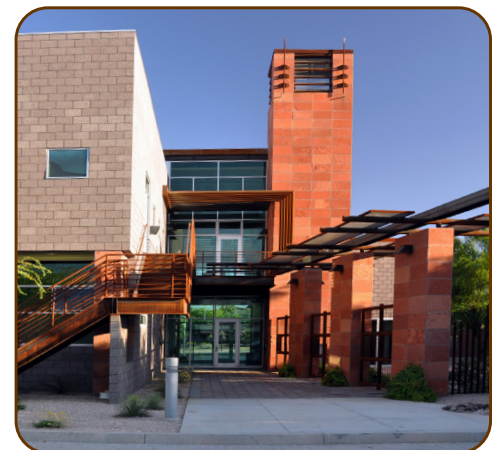
Scottsdale fire station incorporates green building design strategies into its architecture and is LEED certified.