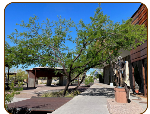
Microclimates result in more usable outdoor space.

Encourage the use of renewable energy within downtown.