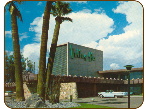
Historic Valley Ho, Circa 1956