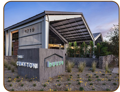
High quality design through adaptive reuse as seen in the Clayton House, a special events venue.

"Pay attention to craftsmanship and quality to create authenticity."