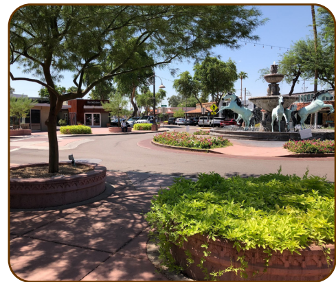
Interconnect downtown public spaces with safe, comfortable and interesting street spaces.