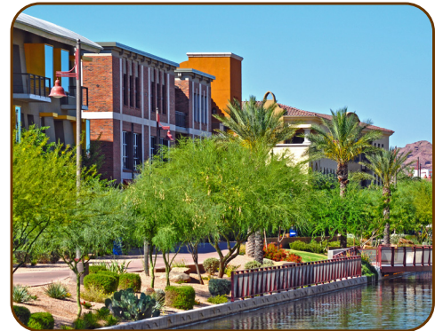
The Arizona Canal is another primary public open space and special event destination in Old Town.

Use development standards and the Old Town Scottsdale Urban Design and Architectural Guidelines regarding building location and setback to enhance the context, rhythm, and features of streetspaces.