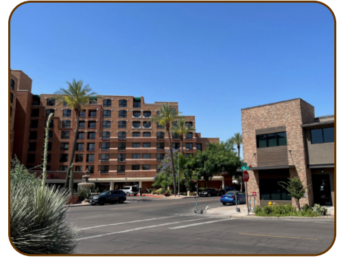
The modern office building (foreground) respectfully next to the Scottsdale Marriott (background) in the Brown & Stetson District. These buildings illustrate that contemporary and traditional building styles can coexist through building massing, compatible materials, and other design elements.

Protect the Downtown Core (Type 1) by encouraging a Sensitive Edge Buffer between higher scale Development Types (Type 2, Type 2.5, and Type 3) and the Downtown Core.