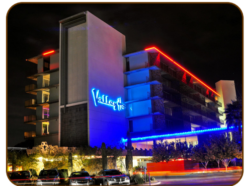
Hotel Valley Ho, Circa 2013

As one of Scottsdale's early resort hotels, the revitalization and expansion of the historic Valley Ho is a good example of a public /private partnership, innovative zoning practices, and a demonstration of the community value to protect its historic resources and unique character.