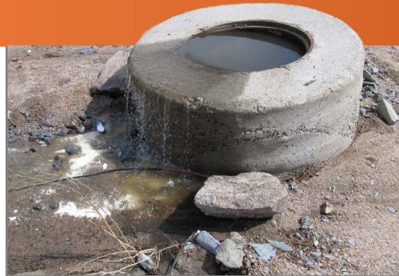
Sanitary sewer overflow caused by FOG

Over time, fats, oils and grease (FOG) from everyday cooking can clog the pipes in your home and in the public sewer system. FOG and food particles poured down the sink solidify in your pipes, eventually causing blockages that can send untreated wastewater backwards – out of manholes or back into your house! Overflows can create serious public health hazards, damage property, cause odor issues and often require expensive repairs.